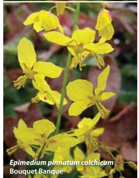
Epimedium pinnatum colchicum Bouquet Banque