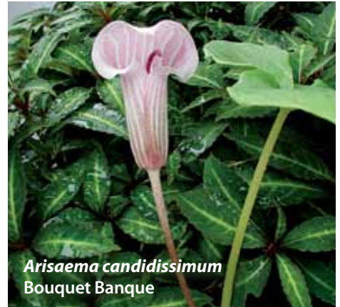
Arisaema candidissimum Bouquet Banque

If you've always wanted a fragrant Arisaema , follow your nose to Bouquet