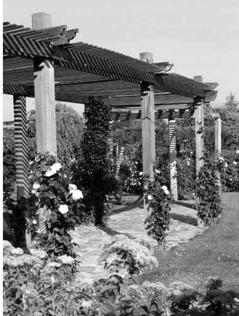
Wyles garden pergola

To reserve your place on the tour, call NPA at 425-647-6004 and send your check to NPA, 19105 36th Ave W, Suite 211, Lynnwood, WA 98036 or visit www.n-p-a.org to pay online.