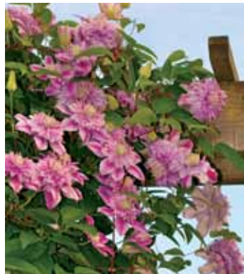
Cathy Atkins garden (Lavenderwood)