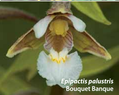
Epipactis palustris Bouquet Banque