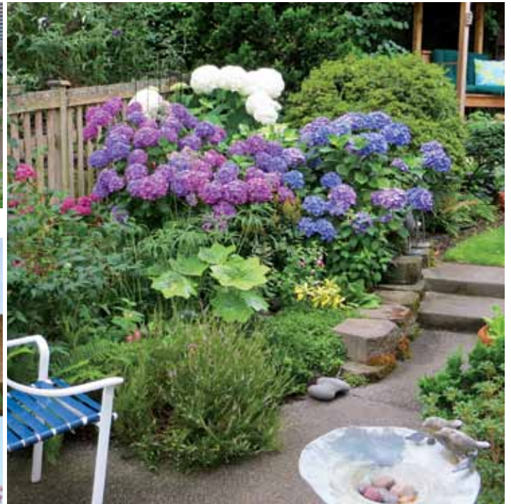
Fran Camber garden