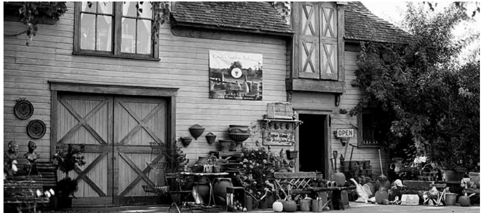
Country Garden Antiques barn