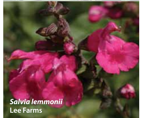
Salvia lemmonii Lee Farms