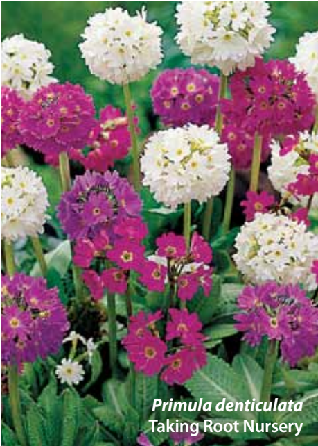
Primula denticulata Taking Root Nursery