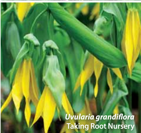
Uvularia grandiflora Taking Root Nursery