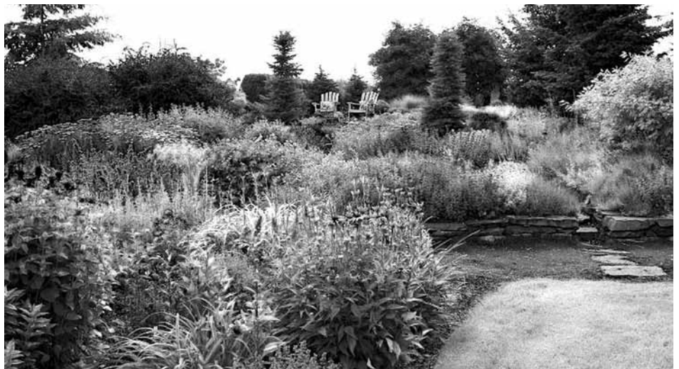
Knutson and Sell Garden