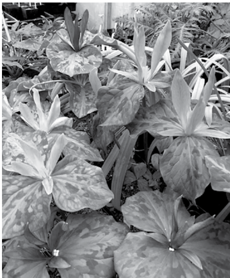
Trillium, Taking Root Nursery

Taking Root Nursery will also have a wide selection of Trilliums. Nearly all of these early bloomers come in threes: three leaves, three flower petals, three